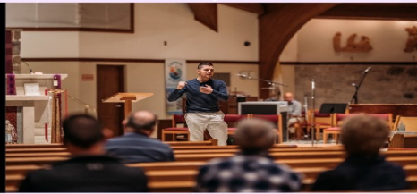
Evangelizing for Christ... one soul at a time