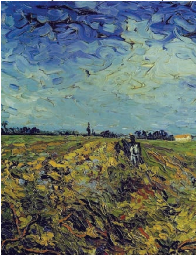
Van Gogh, - The Green Vineyard . 1888

There was a landowner who planted a vineyard, put a hedge around it, dug a winepress in it, and built a tower.