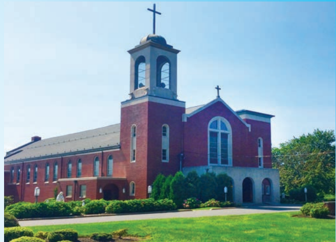
Our Lady of Good Counsel church 137 West Upper Ferry Road, West Trenton,