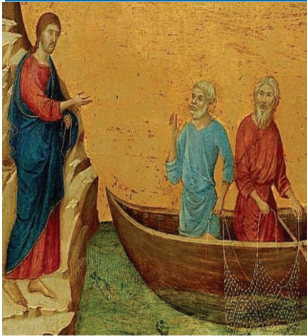
Duccio di Buoninsegna, The Calling of the Apostles Peter and Andrew, 1311

As he passed by the Sea of Galilee, he saw Simon and his brother Andrew casting their nets into the sea; they were fishermen. Jesus said to them, "Come after me, and I will make you fishers of men."