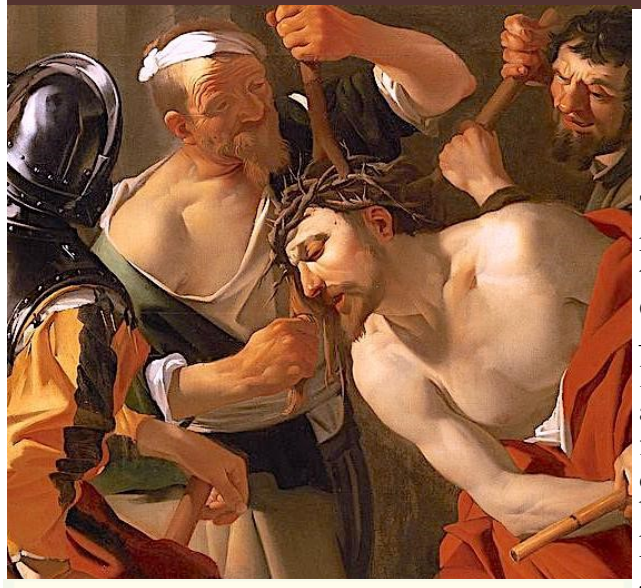
"You say I am a king. For this I was born and for this I came into the world, to testify to the truth." (Gospel)

Reading I: Daniel 7:13-14 Responsorial Psalm: 93:1, 1-2, 5 Reading II: Revelation 1:5-8 Gospel: John 18:33b-37