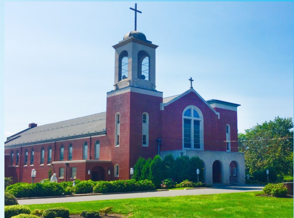
Our Lady of Good Counsel Church 137 West Upper Ferry Road, West Trenton, NJ