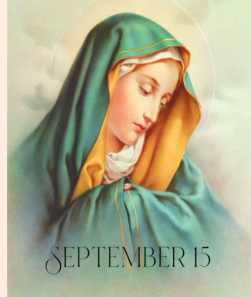
Feast of Our Lady of Sorrows

"PRAY THE ROSARY EVERY DAY IN ORDER TO OBTAIN PEACE FOR THE WORLD" -Our Lady of Fatima, May 13, 1917