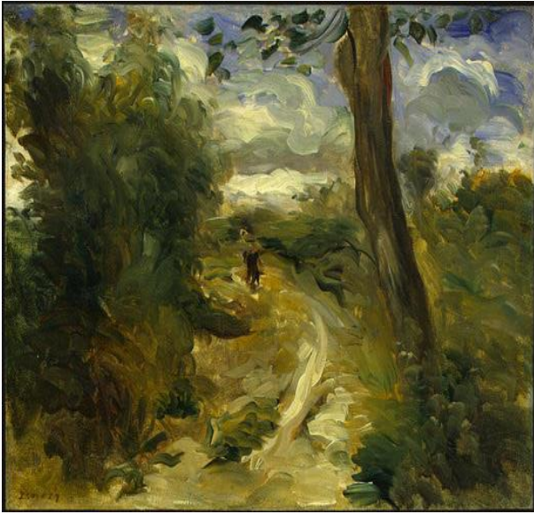
Renoir, Landscape between Storms , 1875

Jesus summoned the Twelve and began to send them out two by two.