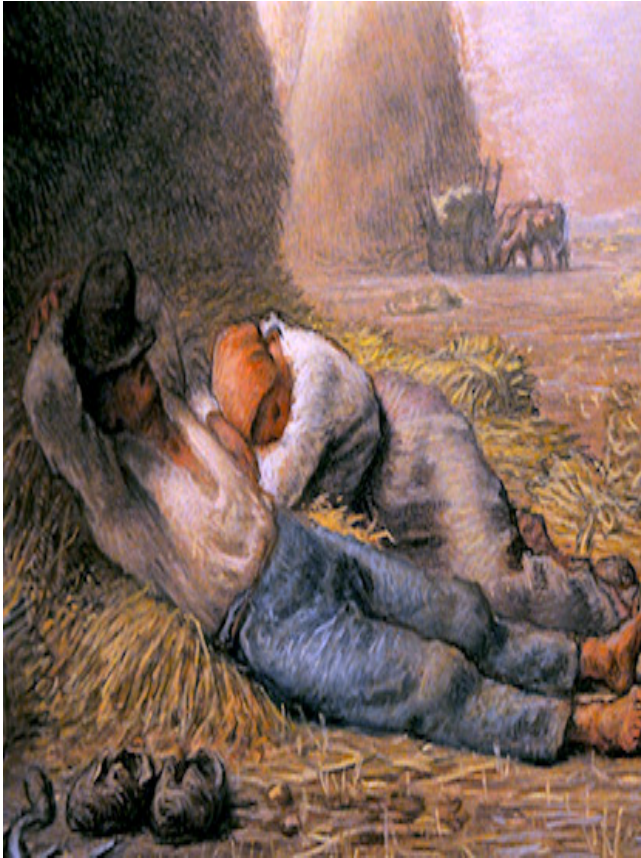
Jean-Francois Millet, Noonday Rest, 1866.

Jesus said to his disciples: Be watchful! Be alert! You do not know when the time will come.