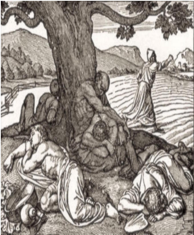
Unknown, The Tares among the Wheat

While everyone was asleep, an enemy came and sowed weeds all through the wheat and then went off. When the crop grew and bore fruit, the weeds appeared as well.