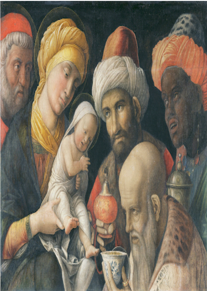
Andrea Mantegna, Adoration of the Magi, 1495.

The Epiphany (which means appearance or revelation) is a call to universal celebration, for the Messiah came to save all men and women. Saint Paul, in his letter to the Ephesians, reminds us that: The Gentiles are coheirs, members of the same body, and copartners in the promise in Christ Jesus through the gospel. As we reflect upon this joyful promise, let us continue to celebrate, the Sacred Liturgy in its entire splendor. Whether at an all-stops-out solemn liturgy, or in the simple celebration of morning Mass, we should always offer our praise and adoration to God in great beauty and simple humility. Our faith is one of great joy, goodness, truth and beauty. As we heard in the Responsorial Psalm: Justice shall flower in his days, and profound peace, till the moon be no more. May he rule from sea to sea, and from the River to the ends of the earth.