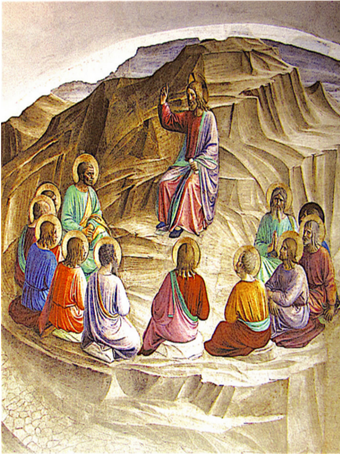
Fra Angelico, The Sermon on the Mount, 1445.

When Jesus saw the crowds, he went up the mountain, and after he had sat down, his disciples came to him. He began to teach them.