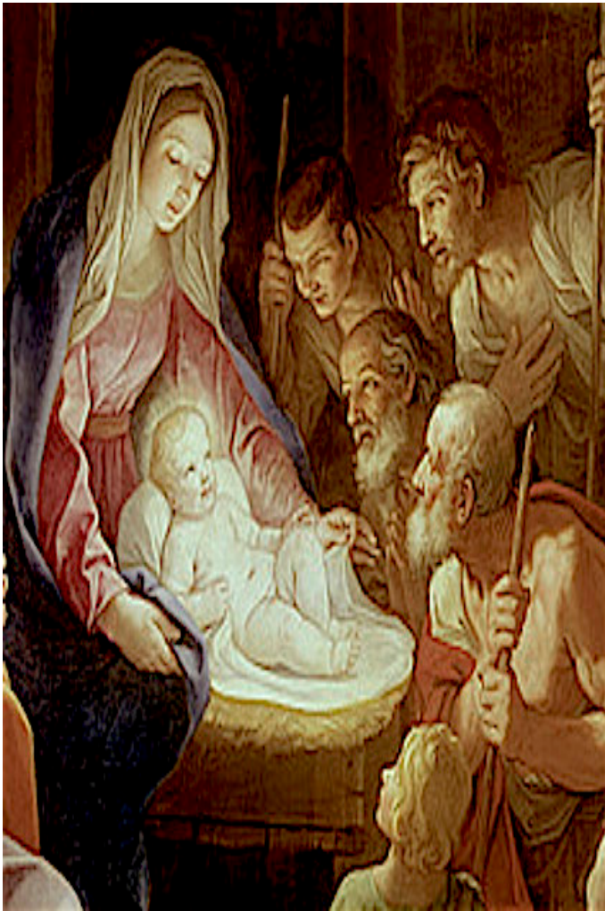
Guido Reni, Nativity at Night, 1640.

May the peace of Christ reside in our hearts, so that we might be a shining example of his goodness as we offer ourselves in service to proclaim the Gospel message.