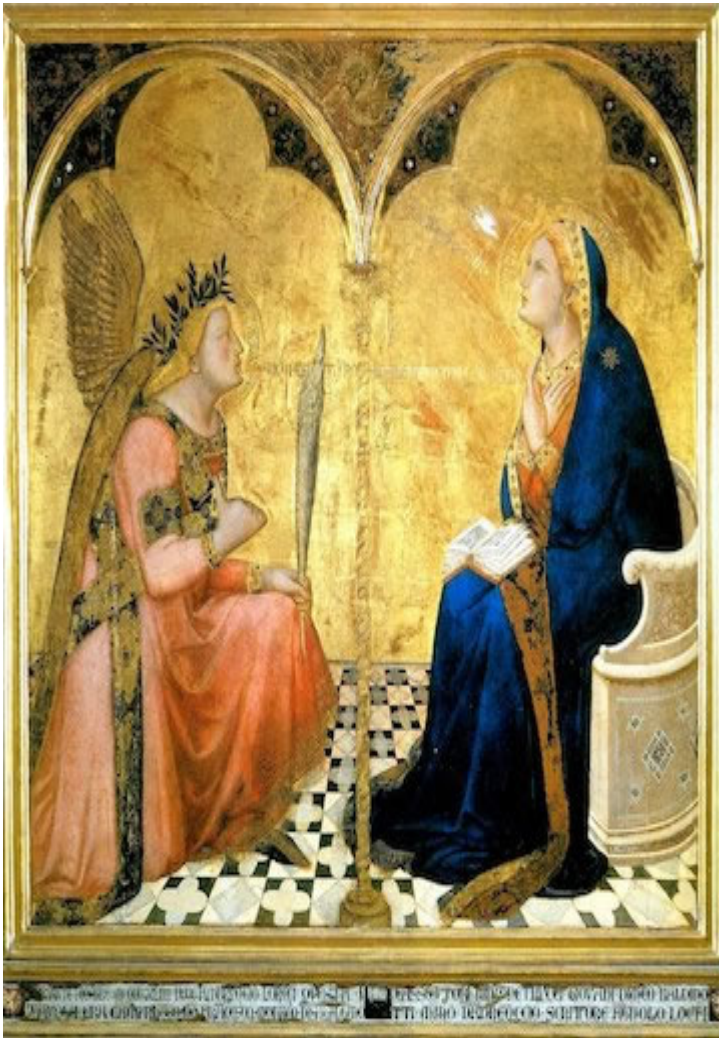
Ambrogio Lorenzetti, Annunciation , 1344.

The story of Christmas is an ancient one, familiar to most of us, yet each year, as it is proclaimed anew, it remains as fresh as it first did on that first night, when the Eternal Word entered into human history. As we celebrate the Birth of Our Lord Jesus Christ, let our hearts and minds be filled with the grace, joy and peace of Our Lord Jesus Christ, who came to save all men and women. And the Word became flesh and made his dwelling among us, and we saw his glory, the glory as of the Father's only Son, full of grace and truth. May all of you, along with your families and friends, have a Merry and Blessed Christmas . . . Glory to God in the highest and on earth peace to those on whom his favor rests.