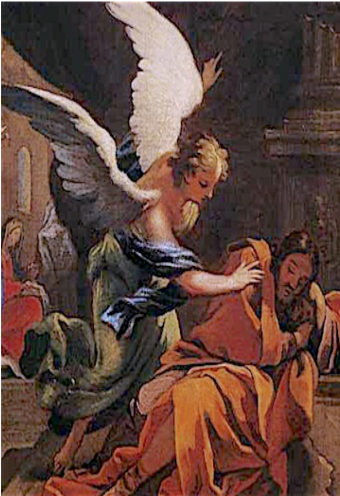
Francisco Goya, Joseph's Dream , 1772.

Joseph, son of David, do not be afraid to take Mary your wife into your home.