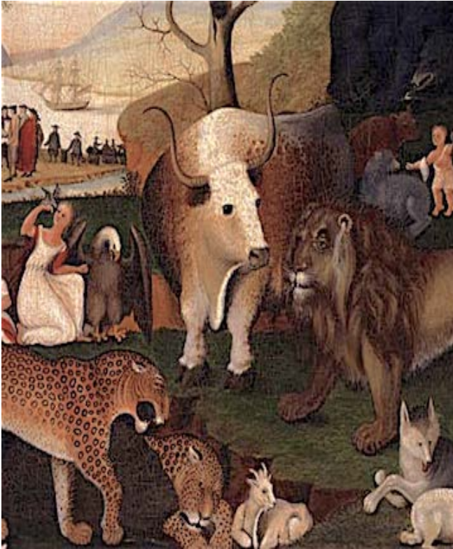
Edward Hicks, The Peaceable Nation , 1845.

Then the wolf shall be a guest of the lamb, and the leopard shall lie down with the kid; the calf and the young lion shall browse together, with a little child to guide them.