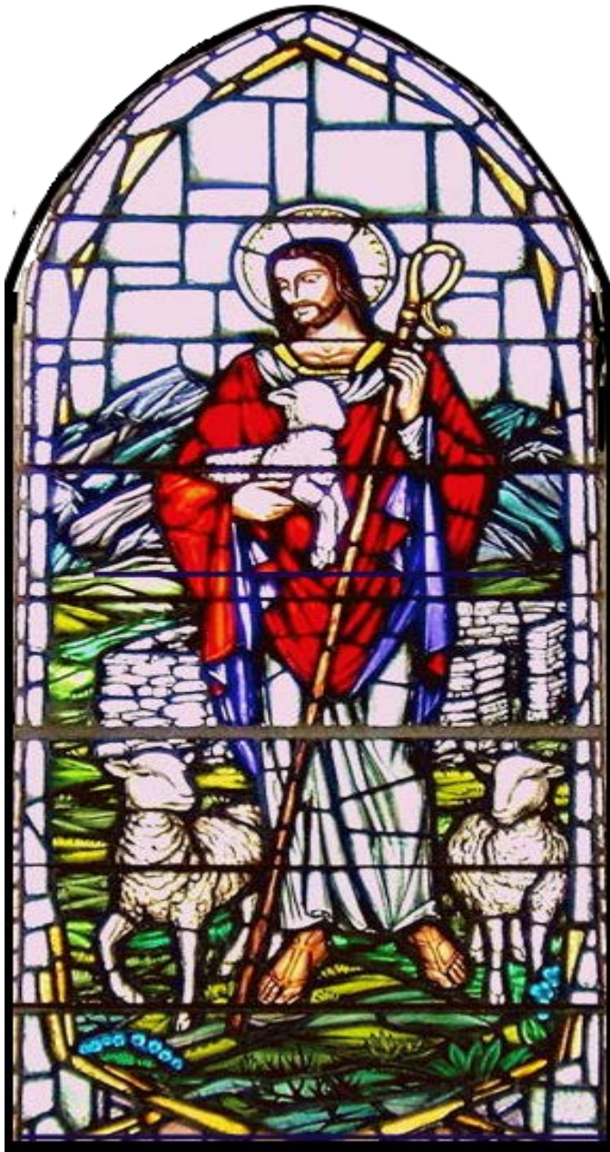
Christ the Good Shepherd, stained glass, St. Tanwg's Church, Wales

Jesus said: I am the good shepherd. A good shepherd lays down his life for the sheep. A hired man, who is not a shepherd and whose sheep are not his own, sees a wolf coming and leaves the sheep and runs away, and the wolf catches and scatters them. I am the good shepherd, and I know mine and mine know me, just as the Father knows me and I know the Father. I have other sheep that do not belong to this fold. These also I must lead, and they will hear my voice, and there will be one flock, one shepherd.