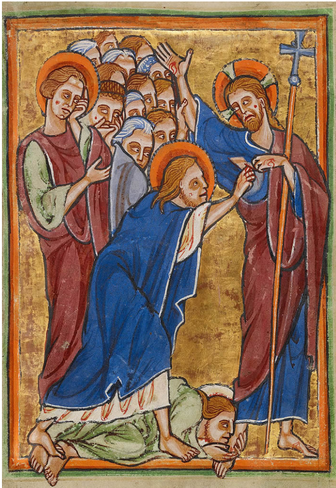
Doubting Thomas, unknown illustrator, 1190.

He said to Thomas: Put your finger here and see my hands, and bring your hand and put it into my side, and do not be unbelieving, but believe.